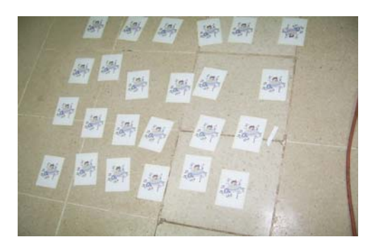
Figure 1. Conceptual card deck on subject of the "Fairy OddParents." Cards are placed on the floor with the concepts facing down. The upface is decorated to make cards more appealing to students.

More recently, and inspired by the conceptual dice, facilitator Rita Marissa Giovani developed the conceptual card deck . The card deck may contain as many cards as desired, on any desired subject. Concepts, either in the form of text, image or both, are placed on one side of the cards. In order to make the cards more attractive to students, they can be made out of Bristol board, of a relatively large in size (for example, 4x5 in), and the side without the concept may be decorated in various ways. Because of their size, cards are placed on the floor, concept-side down (see figure 1). The rules for playing the conceptual card game are detailed in section 2.1.