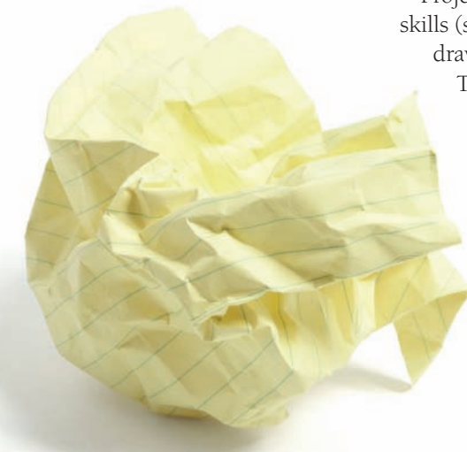
EDUCATIONAL LEADERSHIP / SEPTEMBER 2010

One of the easiest ways to promote ownership is through individual research. For instance, if the class is studying the history of Europe, students could write a report about the country of their choice. They could choose a