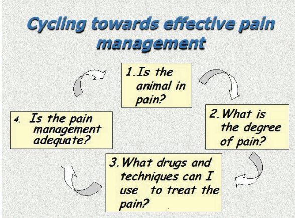
Figure 1 The pain management cycle