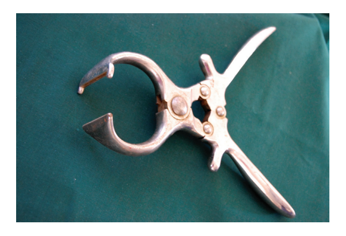
Figure 2. Emasculatome used to crush the spermatic cord of the testes while still inside the scrotum.