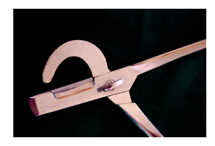
Figure 1. Emasculator used for severing the spermatic cord during surgical castration. Note the rough surface behind the blade that crimps the spermatic cord to minimize bleeding when the blade cuts.

Pain is inherently a part of castration and cannot be avoided. The pain of castration occurs first as acute,