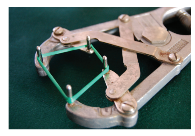
Figure 3. Elastrator used to stretch the rubber band while the band is positioned around the neck of the scrotum above the testes.

and effects of chronic pain may be best measured by evaluating weight change following castration. Two studies in Ireland showed that calves lost weight during the first 7 days after castration, but by 35 days after castration there was generally no difference in calf weight between castrated and uncastrated calves. These results indicate that the chronic pain associated with castration lasts around 1 week.