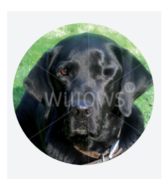
Labrador 'Rachel' a year after enucleation of the left eye

Initially the skin around the operation site may be slightly swollen and bruised but this should resolve over a few days. The hair will grow back over several weeks. The skin over the surgical site will slowly start to sink in slightly as there is nothing in the eye socket to replace where the eye was. This 'sinking in' effect is less obvious in animals with long hair or dark coats than those with short hair and light coloured coats.