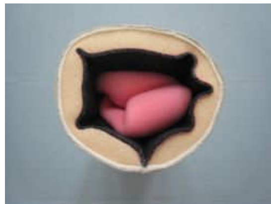
The DASIE—Dog Abdominal Surrogate for Instructional Exercises