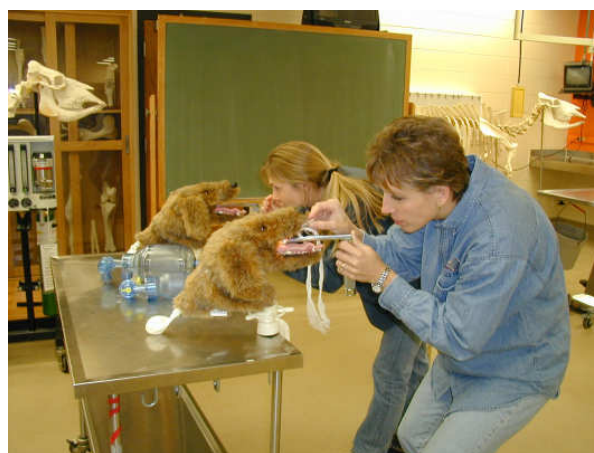
Veterinary students learn intubation using the Rescue Critters® K-9 Intubation Trainer.