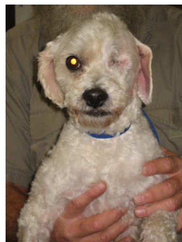
A HAARTS patient recovering from an eye-enucleation.