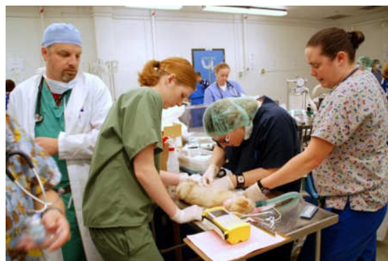
Second, third and fourth-year students prepare a feral cat for surgery and monitor anesthesia under the supervision of an anesthesia resident.

The veterinary college at Iowa State University hosts a similar clinic run by the Feral Cat Alliance, a volunteer group made up of students and faculty from the school. 7