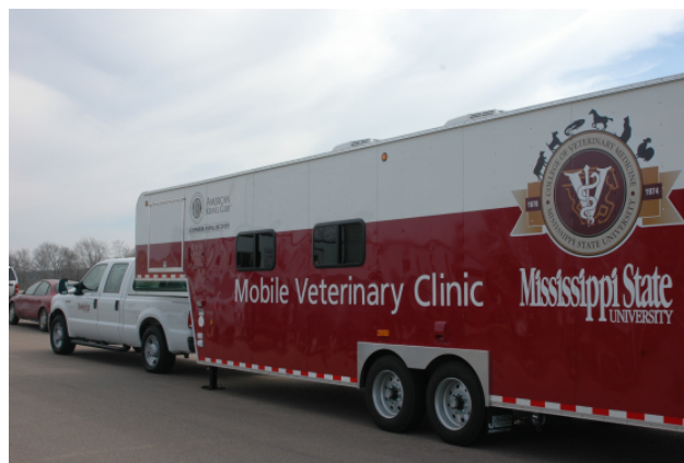
The Mississippi State University's Mobile Veterinary Clinic.

a mobile veterinary unit owned by the school. During that rotation they make two trips to shelters and during those trips perform, on average, between 15 to 20 sterilization surgeries. Both the surgery labs and the CVS shelter trips are now part of the required curriculum. In the fourth year, Mississippi State offers a Shelter