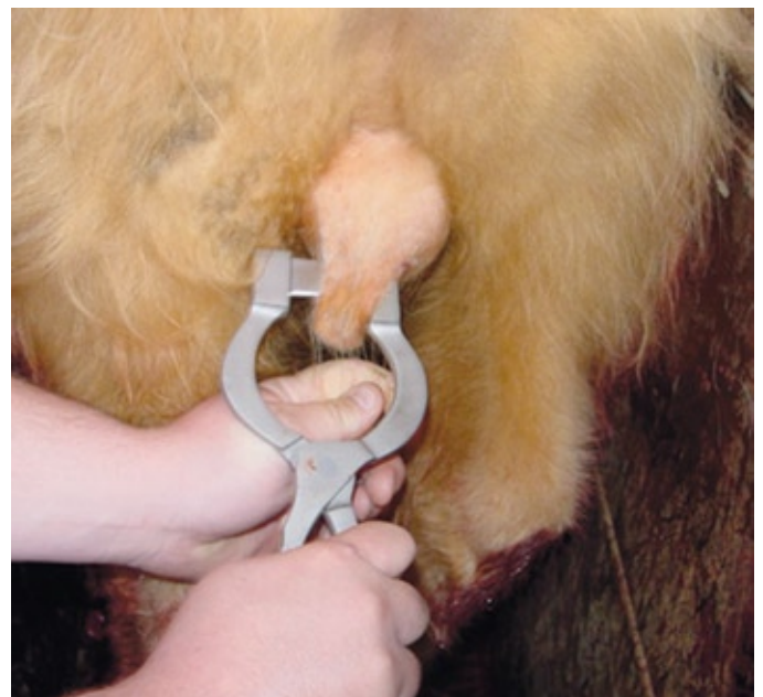
Figure 2. Newberry knife.