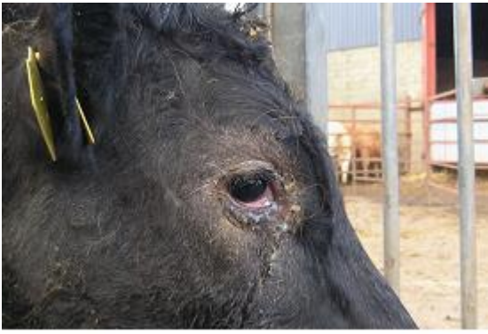
Fig 4: IBR is one of the main differential diagnoses your veterinary practitioner will consider.

Prompt treatment is essential. Topical ophthalmic antibiotic cream containing cloxacillin is commonly used. Antibiotic injection (penicillin, oxytetracycline or ceftiofur) into the dorsal bulbar conjunctiva is the best treatment but can be difficult to achieve in fractious cattle and requires good restraint. Injection into the upper palpebral conjunctiva is commonly used but it should be noted that this technique will not give residual antibiotic levels in the eye and relies on leakage onto the cornea from the injection site. This technique has no advantage over systemic injection except the much lower cost because of the smaller antibiotic dose.