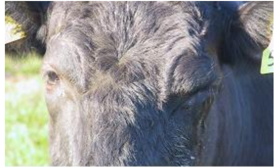
Fig 2: There is marked pain when the eye is exposed to direct sunlight. Note the obvious tear-staining of the face.

Spontaneous recovery may occur in mild cases three to five days after clinical signs are first observed, and is complete two weeks later. In severe cases, ulceration may progress to corneal perforation but this is uncommon.