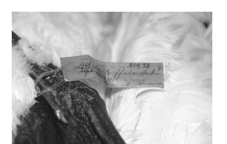
Figure 2. Example of an attached specimen label in the CMN bird study skin collection

As one example of a specific risk, consider the risk of loss of data from labels attached to individual bird study skin specimens. Figure 2 shows a typical example of an attached specimen label. This specific risk may occur as the result of any of