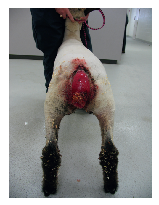
Figure 21-3 Anatomic Class III rectal prolapse. This prolapse was surgically resected to remove the damaged tissue and replace the prolapse.

Once the tissue has sloughed, the tube and band will fall off, and the rectum is reduced.