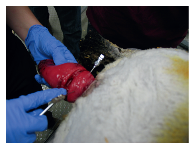
Figure 21-7 Incision distal to the crosspins for amputation.