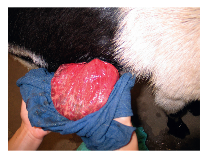
Figure 21-1 Goat presenting for traumatic injury secondary to being gored by a herdmate.

conditions, including ileus. In some cases, supportive care for pain and fluid therapy can be corrective without the need for surgery.