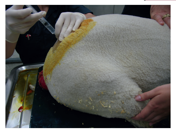
Figure 21-4 Lamb placed in sternal recumbency with hind limbs pulled forward. This opens the lumbosacral space to facilitate placement of a needle for lumbosacral epidural anesthesia.

After anesthesia is attained, a small-diameter rubber or plastic tube is drilled with an offset pair of holes to allow for needles or Steinmann pins to pass through it, forming an X (Figure 21-5). This tube is not required for this procedure but is extremely helpful in identifying the anatomy of the rectal layers during the procedure. This tube is placed into the prolapse, and long (6-inch, 15-cm) needles or Steinmann