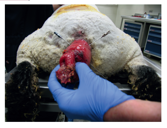
Figure 21-6 Initial cross pinning of the prolapse. The length of this prolapse initially limited placement of a luminal tube, so cross pinning was performed to facilitate amputation of the distal portion with later placement of the tube. See later figures.