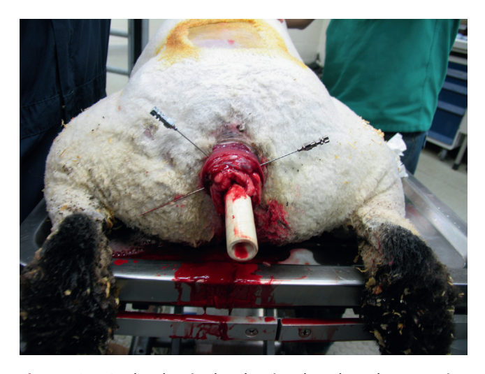
Figure 21-10 The luminal tube is placed and cross pins replaced.