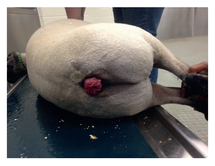
Figure 21-2 Anatomic Class II rectal prolapse in a lamb with a very short tail dock. The mucosa is intact and there is minimal edema. This prolapse was manually reduced and maintained in place with a purse-string suture and injection sclerotherapy.

Recurrent and refractory Class II and all Classes III and IV prolapses require resection (Figure 21-3). Nonsurgical amputation is often selected in market animals and can be performed through the placement of a rigid plastic tube into the lumen and an elastrator band placed proximal to the prolapse in healthy tissue. This results in ischemic necrosis of the distal portion of the prolapse with scarring at the level of the band, which results in anastomosis. The rigid tube maintains a lumen for defecation pending the tissue slough.