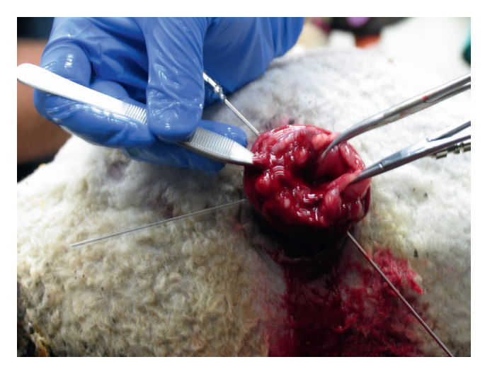
Figure 21-9 The inner large colon is grasped by hemostats and thumb forceps to maintain its exterior placement, and the cross pins are pulled to allow placement of the luminal tube.