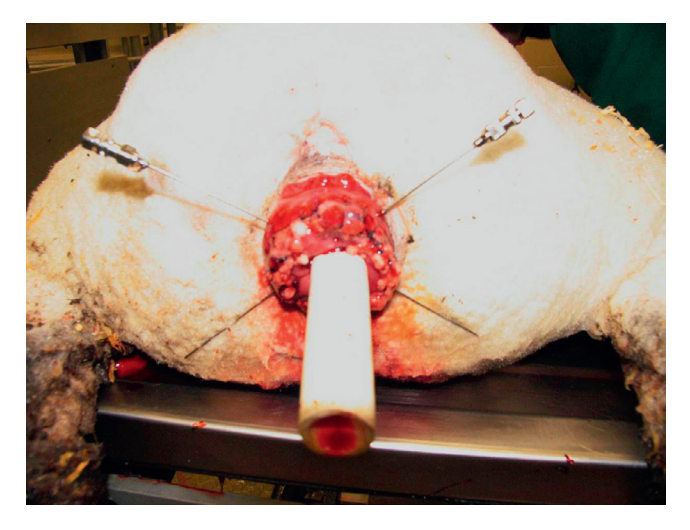
Figure 21-12 The anastomosis is complete and the pins and tube will be removed, allowing for replacement of the prolapse.

filled. A simple interrupted or cruciate pattern is most appropriate (Figure 21-12). Interrupted continuous lines, where a portion is sutured in a continuous pattern and the pattern is stopped and then restarted, may also be used but may be associated with an increased risk of stricture. Once the anastomosis is complete, the needles are pulled and the tube (if used) removed. The rectum is then replaced.