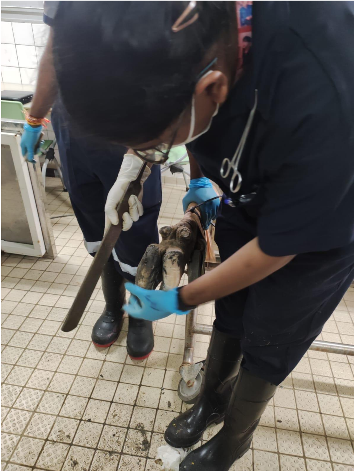
USE OF RASP TO SMOOTHEN THE HOOF