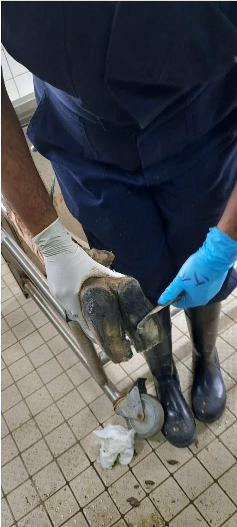
USE OF HOOF KNIFE TO TRIM THE HOOF AFTER WASHING