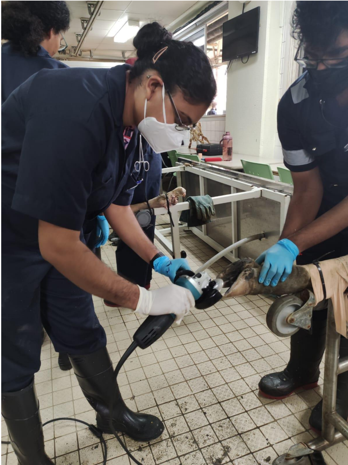
USE OF GRINDER TO TRIM AND SMOOTHEN HOOF