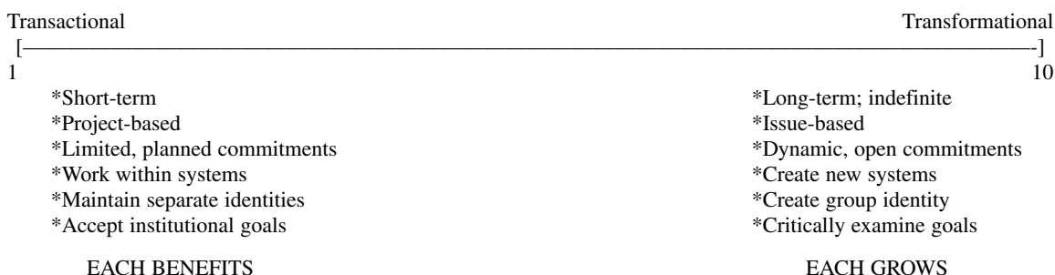
Figure 2 Preliminary Continuum

When constructing the nine items, variable numbers of options were included to capture different possibilities and nuances across the continuum for a particular attribute. The uneven number of response choices for different items was shaped by the desire to present respondents with reasonable choices spanning the conceptual continuum. Some analyses are based on these raw score responses, which were obtained by summing responses to the nine items and finding the mean score for each research participant. Despite the unequal number of response categories, summing or averaging these responses across items