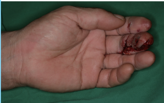
Fig. 4. Postoperative views

A 43-year-old man suffered soft tissue damage on the proximal interphalangeal joint to the fingertip of the left middle finger to the volar and ulnar region. The complete rupture of the flexor digitorum profundus tendon was observed.