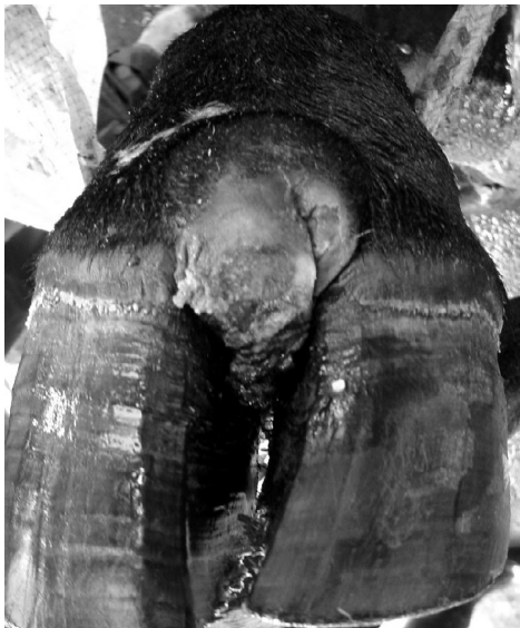
Figures 3 & 4

The two wires are tied together to keep the digits close to each other. A pressure bandage of cotton wool drenched in peroxide is applied. It is not necessary to administer systemic antibiotics.