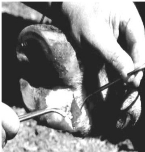
Figures 5 & 6