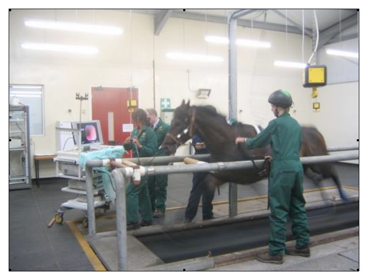
Fig. 3: Racehorse undergoing high speed treadmill endoscopy at the Dick Vet Equine Hospital

Fig. 2: Endoscopic photo taken during high speed treadmill exercise. The horse has complete collapse of the left arytenoid cartilage (b) and vocal fold collapse during breathing in.