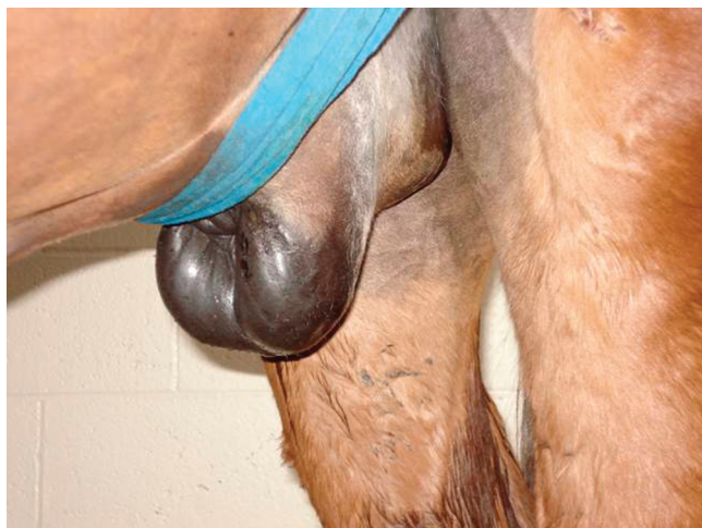
Fig. 1. Horse with excessive post-operative swelling and edema after castration.

by establishing drainage and administering non-steroidal anti-inflammatory drugs (NSAIDs). The horse is sedated, the area is aseptically prepared, and the incision is manually opened and stretched using sterile gloves. It is imperative that the owner follow this treatment up by instituting daily (or twice daily) exercise to prevent premature closure of the incision. If left untreated, excessive swelling can lead to the development of paraphimosis, surgical site infection, and dysuria.