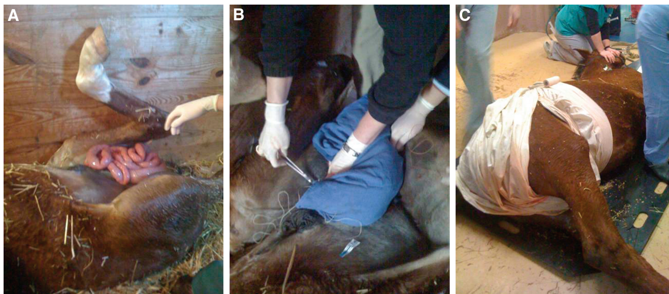
Fig. 3. (A) A yearling that developed small intestinal eventration 4 h after a routine closed castration. Because of the large amount of intestine eventrated, it was not possible to replace it into the scrotum. (B) Therefore, a hand towel was sutured to the skin to form a sling. (C) This was covered with a sheet for additional support during transport to the referral center.

late as 12 days after surgery. 4-7 Risk factors include breed (Standardbreds and Draft Horses are over-represented breeds, and anecdotally, Saddlebreds and Tennessee Walking Horses are also at increased risk), pre-existing inguinal hernias, presence of an inguinal hernia as a foal, and an internal inguinal ring that 2 or more fingers can fit into on rectal palpation. In these cases, it is recommended that a closed or modified open castration with a ligature placed around the cord be performed. A closed castration without a ligature will not decrease the risk of eventration, but the addition of a ligature has been shown to decrease the risk.