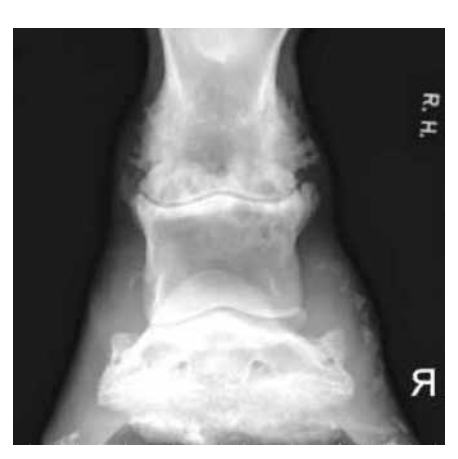
Fig. 2 Dorsoplantar radiographic projection demonstrating osteoarthritis of the proximal interphalangeal joint from horse 8. Osteoarthritis was graded as severe with reduction of joint space, subchondral sclerosis and cyst-like lucencies.