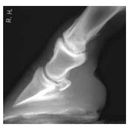
Fig. 1 Lateromedial radiographic projection demonstrating severe osteoarthritis of the proximal interphalangeal joint from horse 8. The subchondral sclerosis and new bone proliferation were typical of most horses in this study.