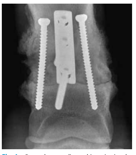
Fig. 4 Dorsoplantar radiographic projection demonstrating placement of implants in the proximal interphalangeal joint joint from horse 8.