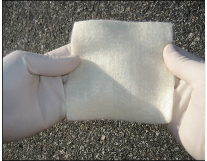
Figure 2. Calcium alginate wound dressing before application to a wound.

clinical trials, hydrogels have been shown to be superior to conventional bandage materials, 17 supporting the view that a moist wound environment is beneficial. Acemannan is derived from aloe vera \beta -(1,4)-acetylated mannan and has been shown to stimulate macrophages by promoting cytokine production, nitric oxide release, surface molecule expression, and cell morphologic changes, 18 resulting in secretion of interleukin 1 and tissue necrosis factor \alpha as well as stimulation of angiogenesis and epidermal growth. 19 Although no studies have evaluated these effects in horses, we have had good results when using acemannan products for wound care in clinical cases. Acemannan has also been shown to be beneficial when used in canine patients. 20 Keeping a wound moist also encourages epithelialization.