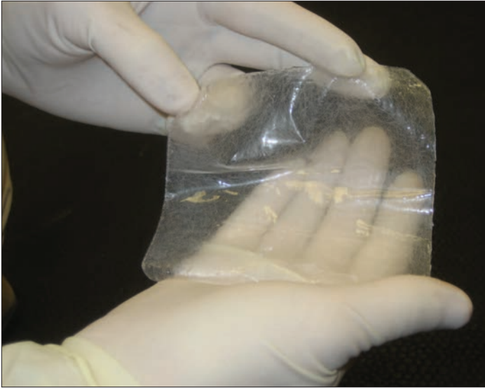
Figure 1. Acemannan hydrogel before application to a wound.