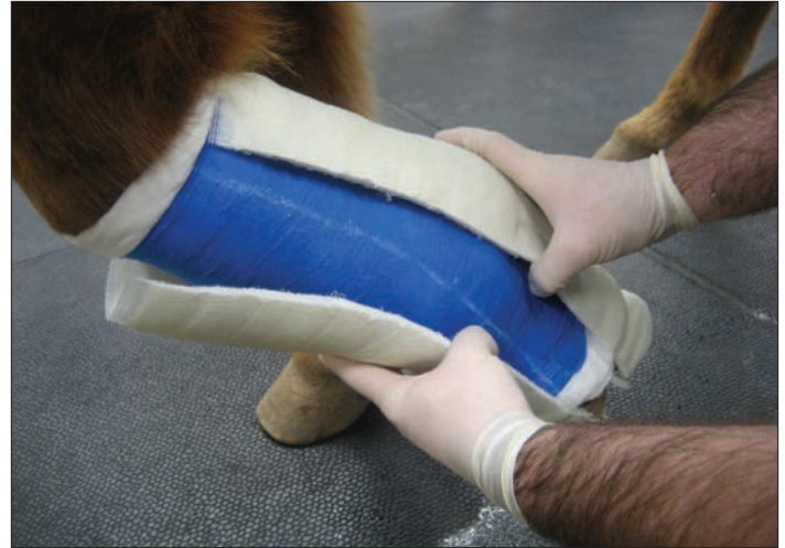
Figure 4. A “hinged” or “soft” bandage cast being removed from a limb. The cast opens laterally and is flexible on the medial side to allow the dorsal aspect of the cast to bend and to be removed or replaced.

Low-level laser therapy (LLLT) has been theorized to promote healing and accelerate recovery. Because the results of many studies have been contradictory, it is unclear whether LLLT is beneficial