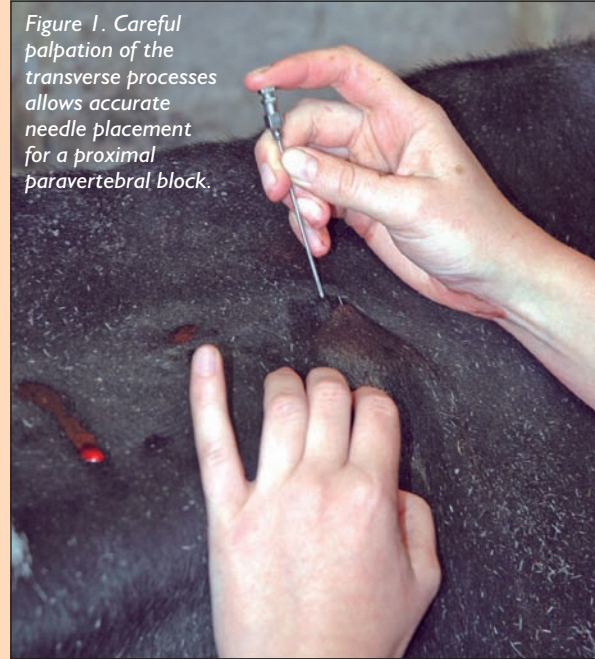
Figure 1. Careful palpation of the transverse processes allows accurate needle placement for a proximal paravertebral block.

an appropriate dose range, pelvic viscera and genitalia are anaesthetised and abdominal contractions are abolished while leaving uterine motility and the locomotor function of the hindlimbs unaffected. Maximal effect is seen 10 to 15 minutes after administration and lasts for around one hour. Lack of anaesthetic effect within 10 minutes usually suggests that the injection was made outside of the epidural space.